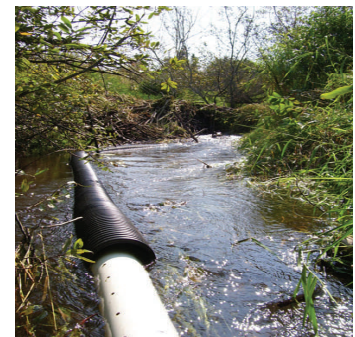
Above right, a Beaver Deceiver pipe allows water to pass through the dam, but the beaver is “deceived” into thinking the water level of his pond is not changing.

Beaver! They continue to be a challenge for some restoration projects. “Plant it and they WILL come!” Depending on the site and the landowners tolerance level for the beaver, JCCD is assessing project areas to know which method of beaver control will work best for each situation. Methods include installing “beaver deceivers” (pipe through dam) or beaver pond levelers to help alleviate flooding, tree wraps to keep beaver from felling the trees, and of course, physical removal.