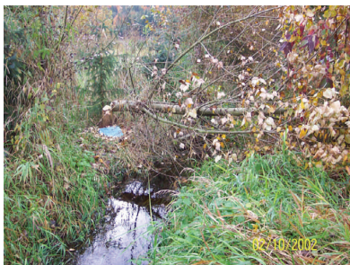
At left, an 11 year old Cottonwood tree in a CREP buffer, felled by beaver.

The Conservation Reserve Enhancement Program (CREP) is part of FSA’s Conservation Reserve Program (CRP). It is a Federal-State partnership between FSA and the Washington Conservation Commission.