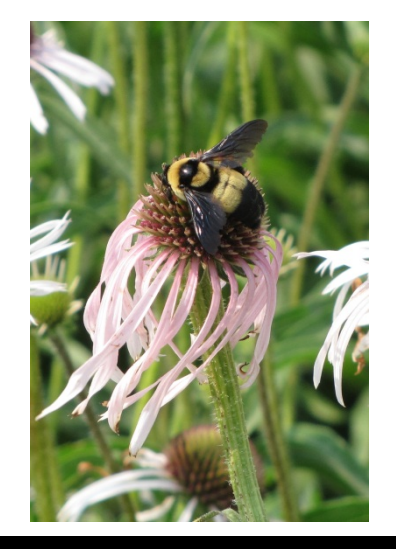
Bumble bee ( Bombus fraternus ) on pale purple coneflower ( Echinacea pallida ).

Keep in mind that small bees may only fly a couple hundred yards, while large bees, such as bumble bees, easily forage a mile or more from their nest. Therefore, taken together, a diversity of flowering crops, wild plants on field margins, and plants up to a half mile away on adjacent land can provide the sequentially blooming supply of flowers necessary to support a resident population of pollinators.