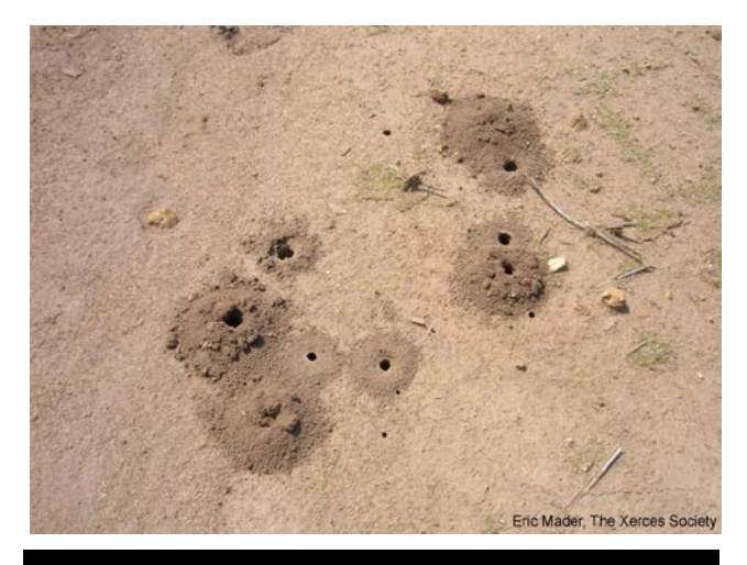
Entrances to these ground nesting bee nests resemble ant hills but have larger entrances.

In order to protect nest sites of ground-nesting bees, tilling and flood-irrigating areas of bare or partially bare ground that may be occupied by nesting bees should be avoided. Grazing such areas can also disturb ground nests. Similarly, using fumigants like chloropicrin for the control of soil borne crop pathogens (such as Verticillium wilt), or covering large areas with plastic mulch could be detrimental to beneficial ground nesting insects like bees.