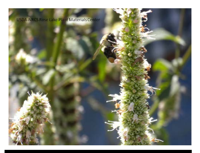
Common Eastern bumble bee ( Bombus impatiens ) on giant yellow hyssop ( Agatache nepetoides ).

This technical note provides information on how to plan for, protect, and create habitat for pollinators in agricultural settings. Pollinators are an integral part of our environment and our agricultural systems; they are important in 35% of global crop production. Animal pollinators include bees, butterflies, moths, wasps, flies, beetles, ants, bats, and hummingbirds. This technical note focuses on native bees, the most important pollinators in temperate North America, but also addresses the habitat needs of butterflies and, to a lesser degree, other beneficial insects.